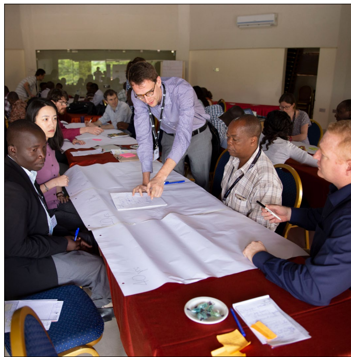
HyCRISTAL Annual General Meeting 2018 in Kampala.

in 2018 and 2019. Results were shared with stakeholder at a workshop in 2019 with representatives from Uganda and the East African Community. Engagement with the World Bank uncovered the apprehension of stakeholders in dealing with uncertainty, however successive calls aided in building a common ground in understanding the needs and possibilities. These engagements help shift consultants away from cost-benefit approaches towards incorporating risks based on plausible ranges.