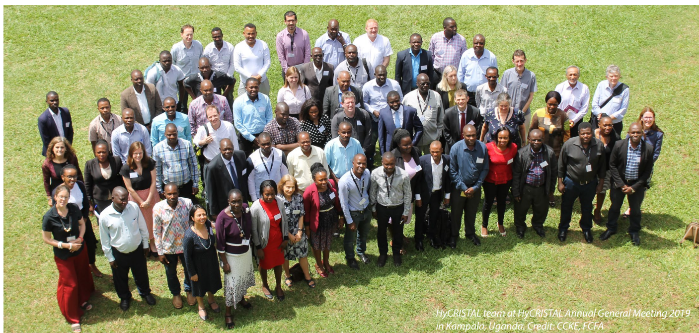
HyCRISTAL team at HyCRISTAL Annual General Meeting 2019 in Kampala, Uganda.