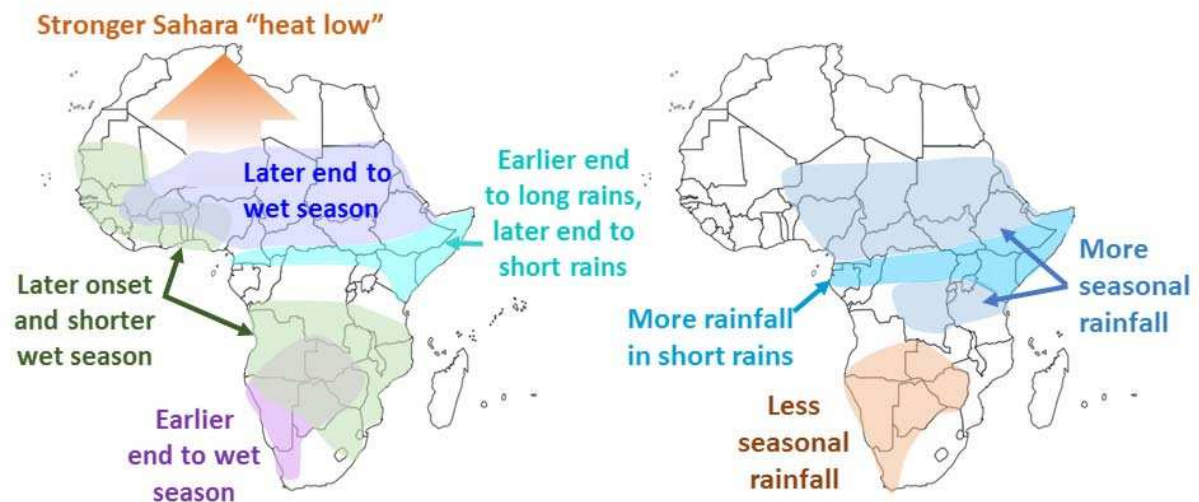
Figure 2. Schematic showing changes in timing of the wet season (left) and changes in seasonal rainfall totals (right) for end-of-century under a business-as-usual scenario (RCP8.5).

There have only been a few studies to date describing how future climate change could affect the timing of the rainy seasons (Cook and Vizy, 2012, Dunning et al., 2018). These studies have given some useful indications of potential changes, as well as the drivers of change, in East Africa's rainfall seasons. Notably, a summary from Dunning et al. (2018) of Africa-wide changes are given in figure 2. For East Africa, they are earlier cessation of the long rains, later cessation of the short rains, and more rainfall during the short rains: although variations between models means that the sign of change in both seasons remains uncertain. However, the different responses over other parts of Africa highlight the need for the East Africa focus that HyCRISTAL has provided.